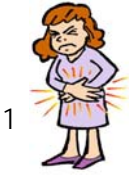
I've got a stomachache