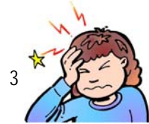
I've got a headache