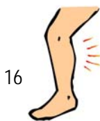
I've torn a muscle