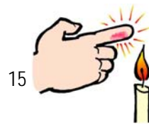
I burnt my finger