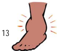
I sprained my ankle