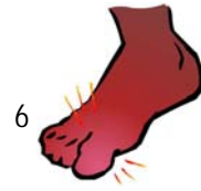
I've got a broken toe