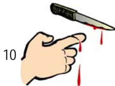
I cut my finger