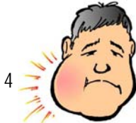
I've got toothache