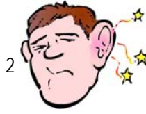
I've got earache