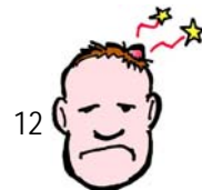
I bumped my head