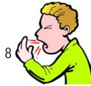
I've got a cough