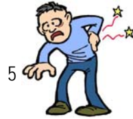
I've got a sore back