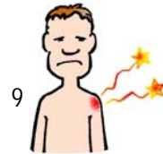
I hurt my shoulder